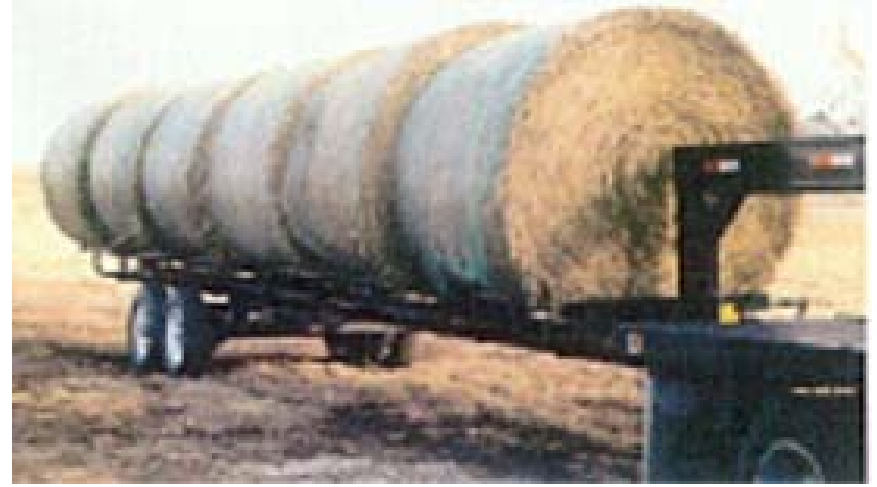
E-Z Haul Hay Handler round bale gooseneck trailer (Photo # 10)