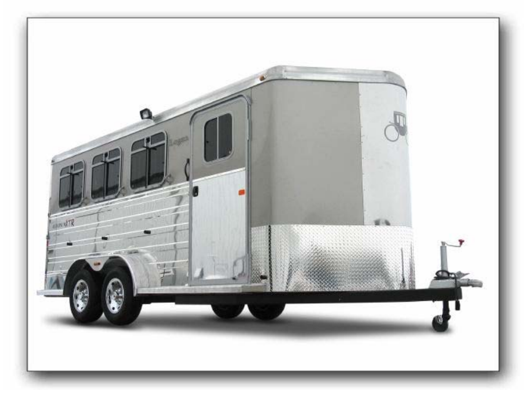
2 Horse bumper pull trailer with dressing room (Photo # 11)