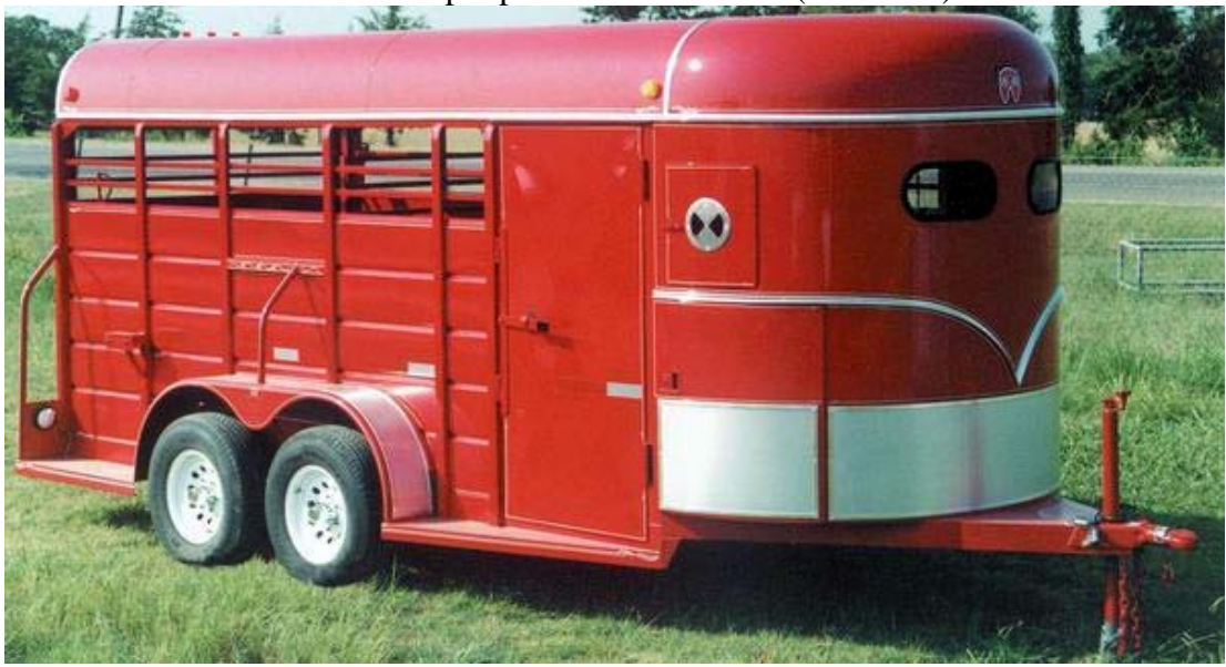
6 x 16 Bumper pull livestock trailer (Photo # 7)